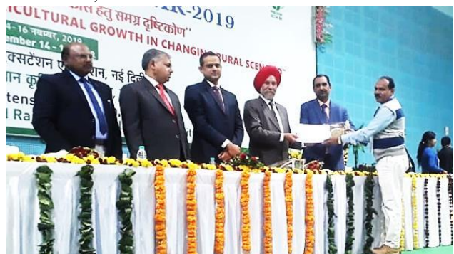
Rajasthan Agricultural University, Bikaner (Rajasthan) from 14-16 th November, 2019.